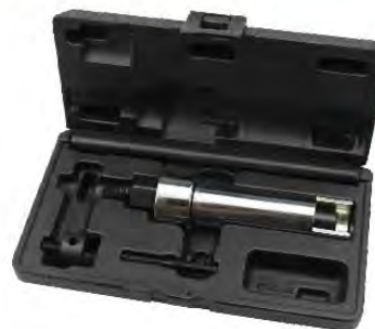
Clutch shaft extraction