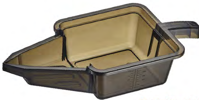
Drain Pan with Level Scale